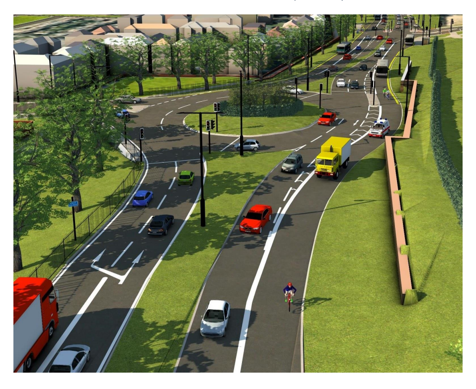
9 - Greenwood Road Roundabout (East to West)