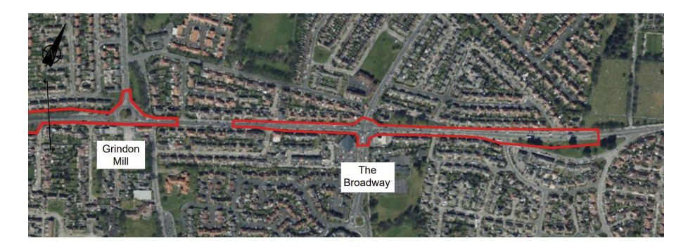
3 - Bus Lane Extents - East