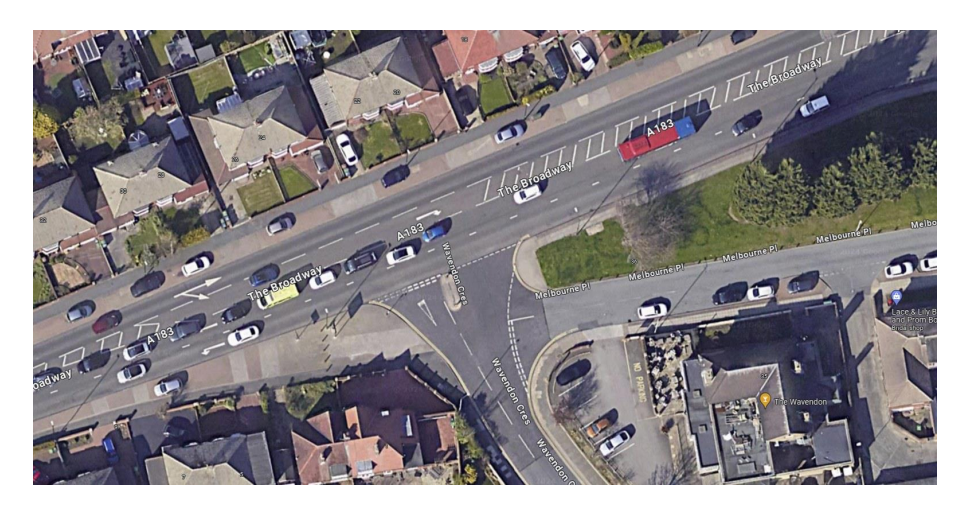
12 - A183 at the junction of Wavendon Crescent