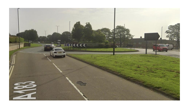
7 - A183 Roundabout junction with Greenwood Road