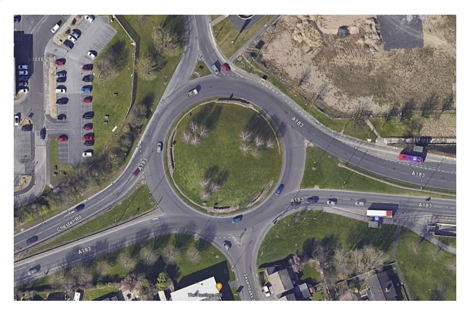
4 - A183 Roundabout junction with Sevenoaks Drive