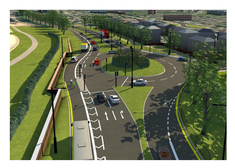
10 - Greenwood Road Roundabout (West to East)