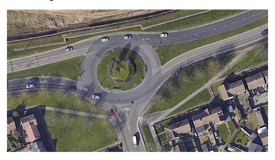
6 - A183 Roundabout junction with Greenwood Road