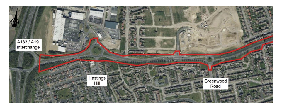
2 - Bus Lane Extents - West