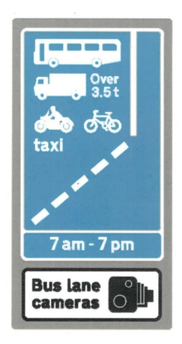
{\it 1-Proposed Sign Showing Permitted Vehicles in Bus Lane}\\