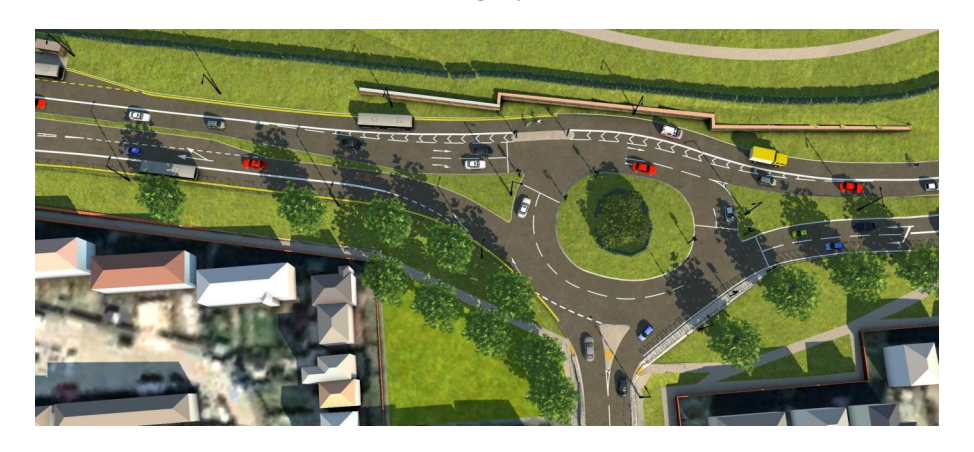
8 - Greenwood Road Roundabout (Overview)