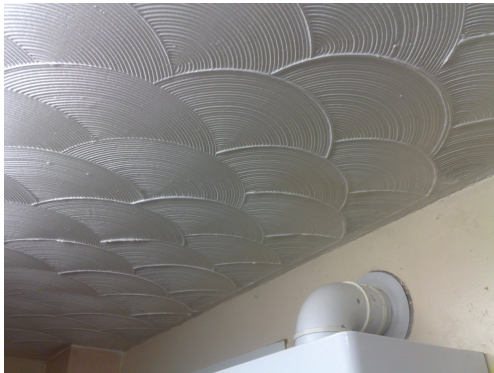
Item 1 Ref: NO09/4028

The textured coating to the ceiling in the kitchen does not contain asbestos.