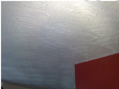
Item 3 - Ref: NO09/4030

The sink pad to the kitchen does not contain asbestos.