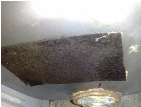
Item 2 - Ref: NO09/4028

The textured coating to the ceiling in the kitchen does not contain asbestos.