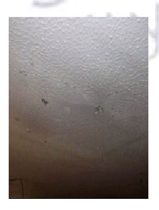
Item 3 - Ref: VP002052

The putty round door frame to glass Room 1 (Reception Lobby) does not contain asbestos.