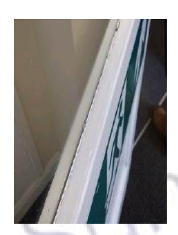
Item 2 - Ref: VP002051

The red screed to floor in Room 1 (Reception Lobby) does not contain asbestos.