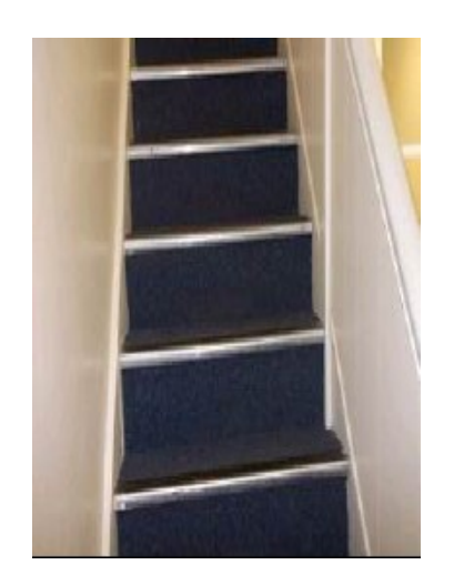
Item 9 - Ref: VP002055

The Stairtread to Room 9 does not contain asbestos.