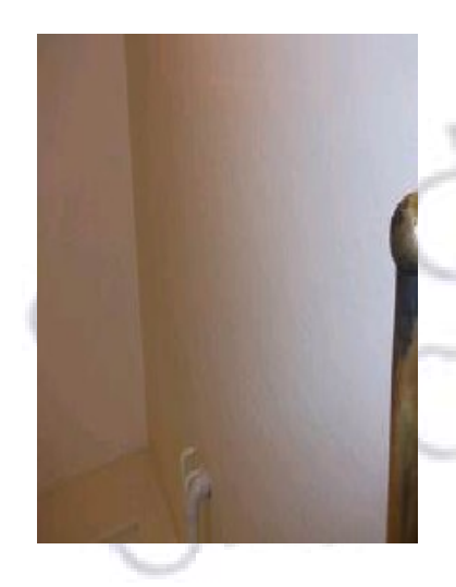
Item 10 - VP002056

The Stairtread to Room 9 does not contain asbestos.