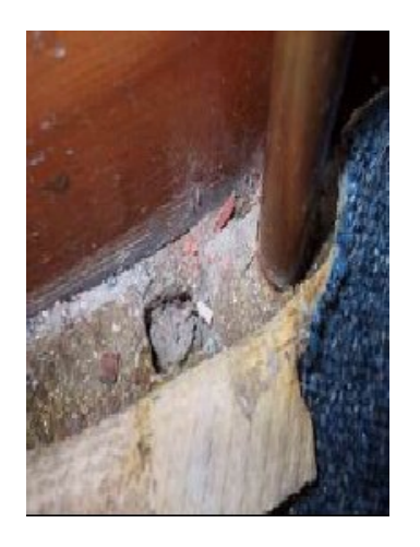
Item 5 - Ref: VP002050

Red screed floor in Room 5 (Corridor) does not contain asbestos.