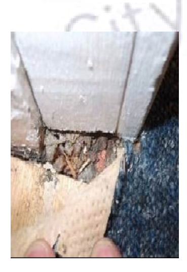
Item 7 - Ref: VP002050

Putty around door frame to glass at rear of corridor in Room 5 does not contain asbestos.