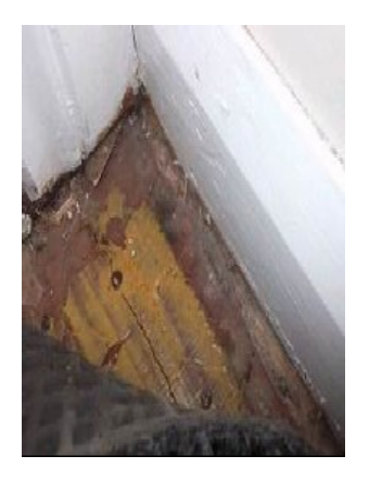
Item 1 Ref: VP002050

The red screed to floor in Room 1 (Reception Lobby) does not contain asbestos.