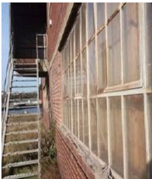
Item 23 – Ref: VP002073

The gasket to the pipe to the external does not contain asbestos.