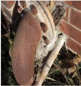
Item 21 – Ref: VP002071

The lagging to the pipe to the external does not contain asbestos.