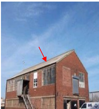
Item 24 – Ref: VP002073

The window putty to the external windows does not contain asbestos.