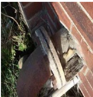
Item 22 – Ref: VP002072

The lagging to the pipe to the external does not contain asbestos.