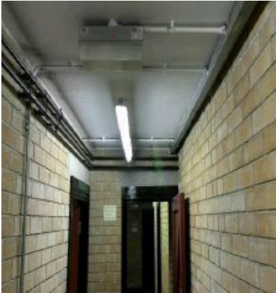
Item 13 - Ref: EA003015

The textured coating to the ceiling in the small corridor (Room 9) does not contain asbestos.