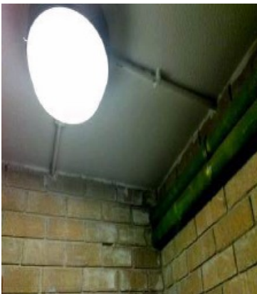
Item 32 - As EA003015

The textured coating to the ceiling in the officials shower (Room 21) does not contain asbestos.