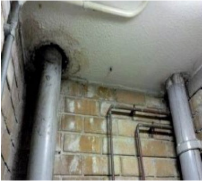
Item 34 – Ref: EA003018

The textured coating to the ceiling in the store (Room 23) does not contain asbestos.