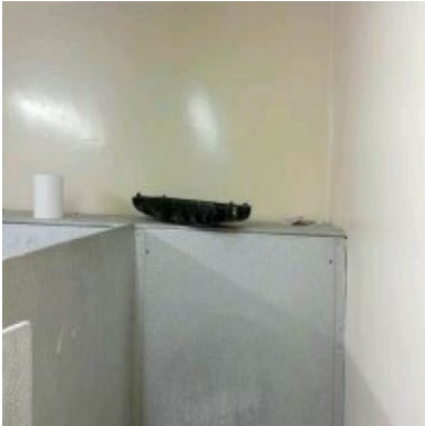
Item 16 - Ref: EA003016

The cistern lid on the boxing in the female WC (Room 11) does not contain asbestos.