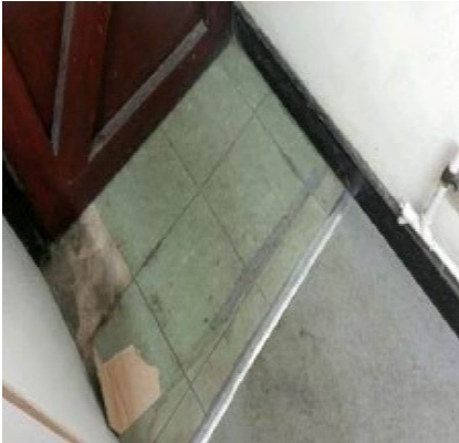
Item 19 - Ref: EA003017

The green floor tiles to the kitchen (Room 13) do not contain asbestos.