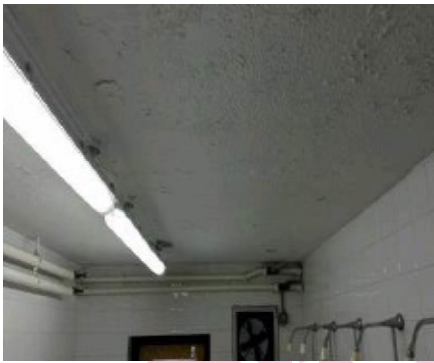
Item 8 - Ref: EA003009

The textured coating to the ceiling in the Male WC (Room 6) does not contain asbestos.