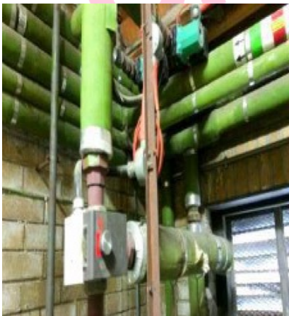
Item 9 - Ref: EA003011

The textured coating to the ceiling in the shower room (Room 7) does not contain asbestos.