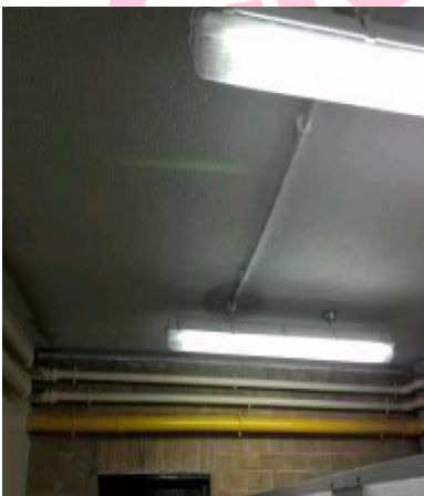
Item 15 - As EA003015

The textured coating to the ceiling in the showers (Room 10) does not contain asbestos.