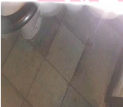
Item 33 - As EA003017

The textured coating to the ceiling in the officials WC (Room 22) does not contain asbestos.