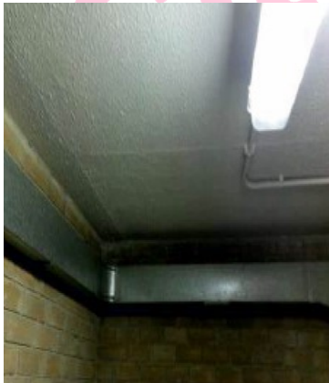
Item 30 - As EA003018

The textured coating to the ceiling in changing room 2 (Room 19) does not contain asbestos.