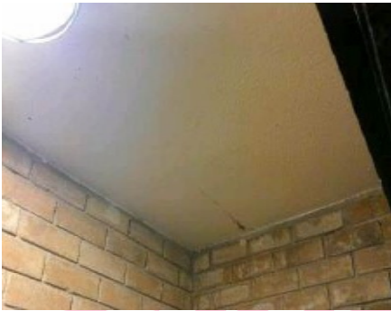
Item 35 - As EA003018

The textured coating to the ceiling in the store (Room 23) does not contain asbestos.