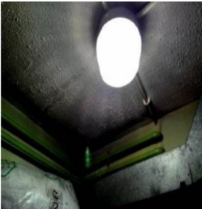
Item 20 - As EA003015

The green floor tiles to the kitchen (Room 13) do not contain asbestos.