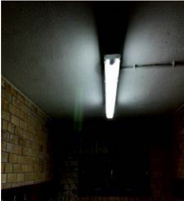
Item 28 – Ref: EA003018

The textured coating to the ceiling in changing room 1 (Room 18) does not contain asbestos.