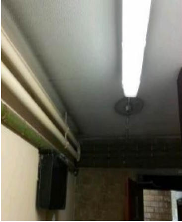
Item 7 - Ref: EA003009

The textured coating to the ceiling in the Male WC (Room 6) does not contain asbestos.