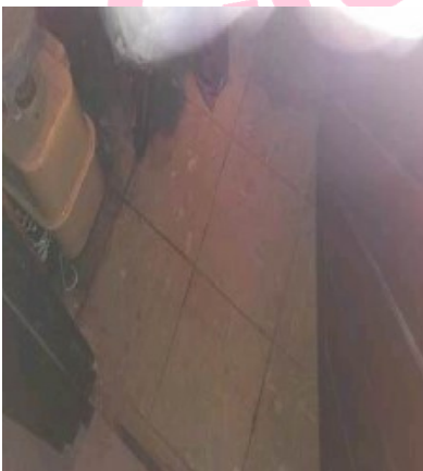
Item 21 - As EA003017

The textured coating to the ceiling in the gas meter cupboard (Room 14) does not contain asbestos.