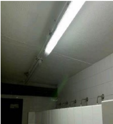
Item 14 - As EA003015

The textured coating to the ceiling in the small corridor (Room 9) does not contain asbestos.