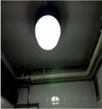
Item 31 – Ref: EA003018

The textured coating to the ceiling in the officials shower (Room 21) does not contain asbestos.