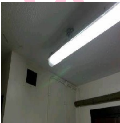
Item 18 - As EA003015

The textured coating to the ceiling in the lobby (Room 12) does not contain asbestos.