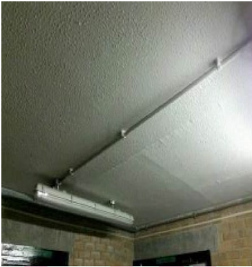
Item 17 - As EA003015

The cistern lid on the boxing in the female WC (Room 11) does not contain asbestos.