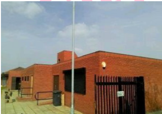
Item 36 – Presumed

The textured coating to the ceiling in the store (Room 24) does not contain asbestos.