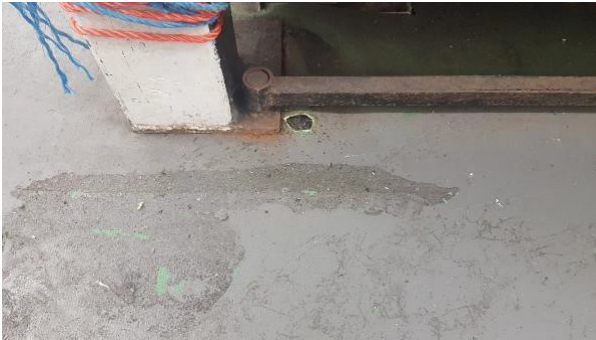
Item 20 Ref: PFB/002

The flooring composite (Gym Area) does not contain asbestos.