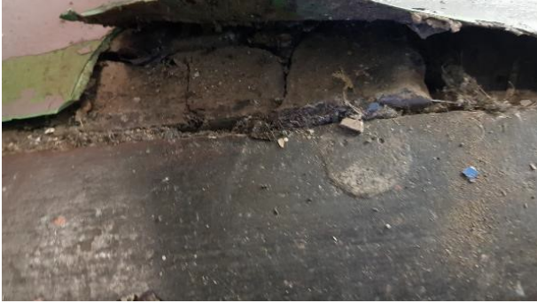
Item 19 Ref: PFB/001

The flooring composite (Gym Area) does not contain asbestos.