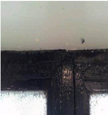
Item 26 As EF003180

The window putty to the shower (Room 11) does not contain asbestos.