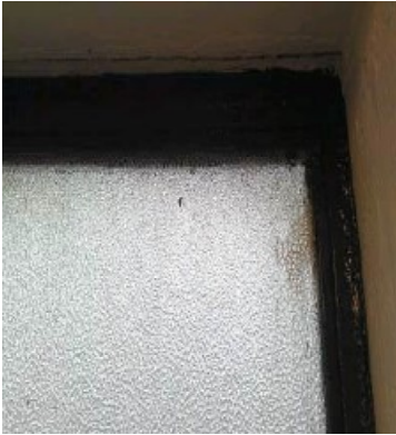
Item 28 As EF003179

The window putty to the shower room 2 (Room 12) does not contain asbestos.