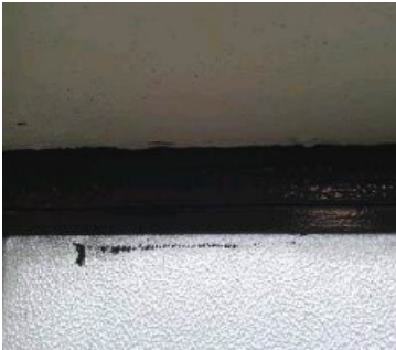
Item 14 As EF003180

The window putty to changing room 3 (Room 6) does not contain asbestos.