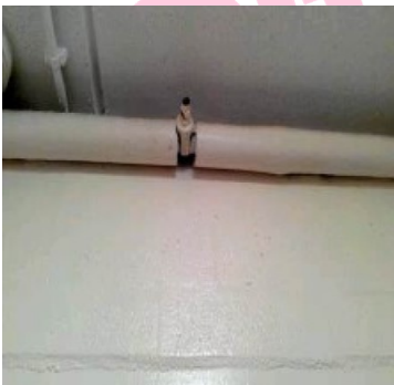
Item 30 As EF003174

The window mastic to the shower room 2 (Room 12) does not contain asbestos.