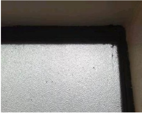
Item 31 As EF003179

The window putty to toilet 2 (Room 13) does not contain asbestos.