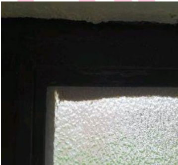
Item 15 As EF003180

The window mastic to changing room 3 (Room 6) does not contain asbestos.