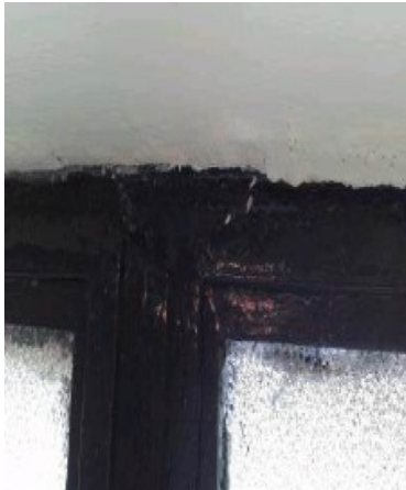
Item 23 As EF003180

The window putty to changing room 4 (Room 10) does not contain asbestos.