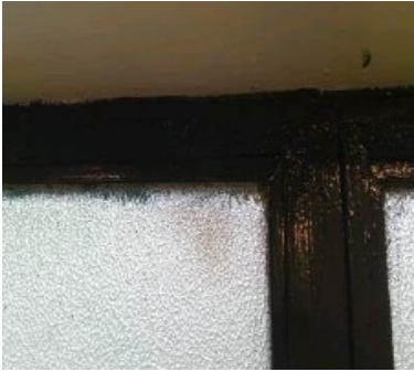
Item 25 As EF003179

The window putty to the shower (Room 11) does not contain asbestos.