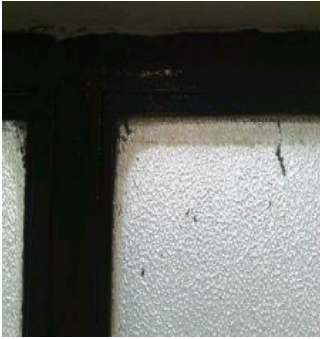
Item 13 As EF0031879

The window putty to changing room 3 (Room 6) does not contain asbestos.