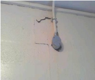
Item 8 – EF003178

The textured coating to the ceiling in corridor 1 (Room 2) does not contain asbestos.