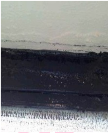
Item 29 As EF003180

The window putty to the shower room 2 (Room 12) does not contain asbestos.