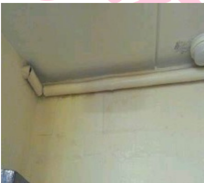
Item 27 As EF003174

The window mastic to the shower (Room 11) does not contain asbestos.