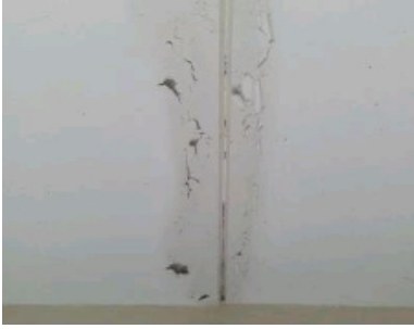
Item 7 – EF003177

The textured coating to the ceiling in corridor 1 (Room 2) does not contain asbestos.