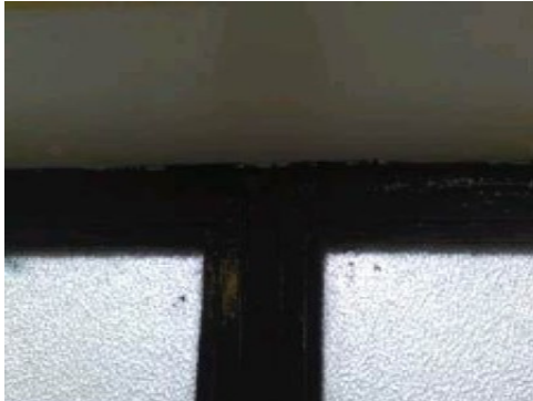
Item 32 As EF003180

The window putty to toilet 2 (Room 13) does not contain asbestos.