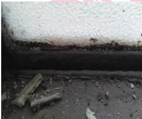
Item 33 As EF003179

The window mastic to toilet 2 (Room 13) does not contain asbestos.