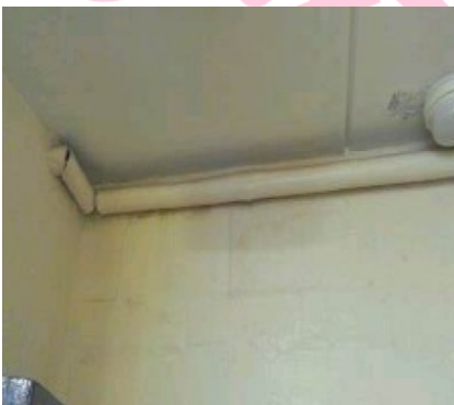
Item 27 As EF003174

The window mastic to the shower (Room 11) does not contain asbestos.