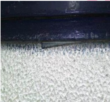
Item 9 – EF003179

The textured coating to the walls in corridor 1 (Room 2) does not contain asbestos.