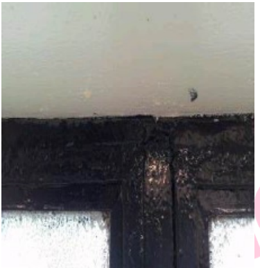
Item 26 As EF003180

The window putty to the shower (Room 11) does not contain asbestos.