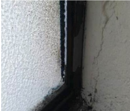
Item 22 As EF003179

The window putty to changing room 4 (Room 10) does not contain asbestos.