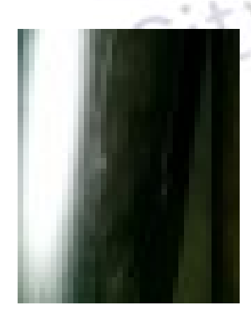
Item 3 Ref: 76709-3

The floor covering in the Bathroom containS asbestos. Any change in its appearance should be recorded, and passed to Property Services.