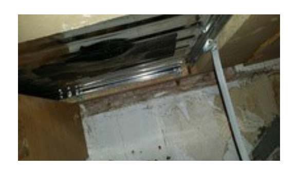
Item 1 Ref: 76709-1

The sink pad in the kitchen does not contain any asbestos.