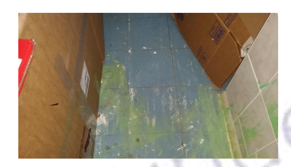
Item 2 Ref: 76709-2

The sink pad in the kitchen does not contain any asbestos.