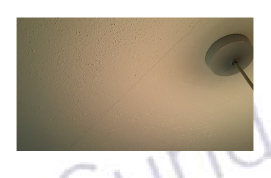
Item 5 - Ref: As 76709-4

The textured coated ceiling in the Bedroom contains asbestos. Any change in its appearance should be recorded, and passed to Property Services.