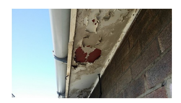
Item 13 - Ref: 76709-11

The soffitt contains asbestos. Any change in its appearance should be recorded, and passed to Property Services.