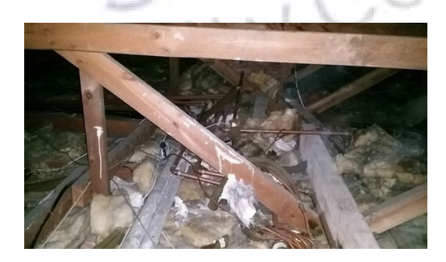
Item 12 - Ref: 76709-10

The debris pipe in the loft does contain asbestos. Any change in its appearance should be recorded, and passed to Property Services. There should be no access to the loft until an environmental clean is carried out.