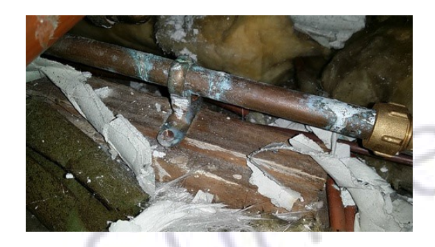
Item 11 - Ref: 76709-9

The debris below non asbestos lagging in the loft does contain asbestos. Any change in its appearance should be recorded, and passed to Property Services. There should be no access to the loft until an environmental clean is carried out.