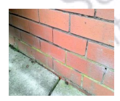
Item 12 - Ref: EA003021

The textured coating to the ceiling in the male wc (Room 6) does not contain asbestos.