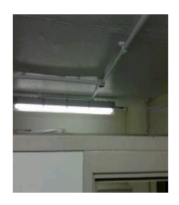
Item 7 - Ref: EA003020

The textured coating to the ceiling in the female wc (Room 4) does not contain asbestos.