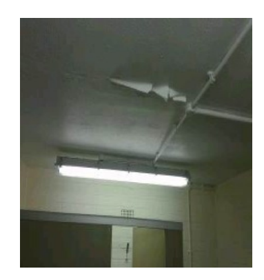
Item 11 - Ref: EA003020

The green vinyl floor tiles to the male wc (Room 6) does not contain asbestos.