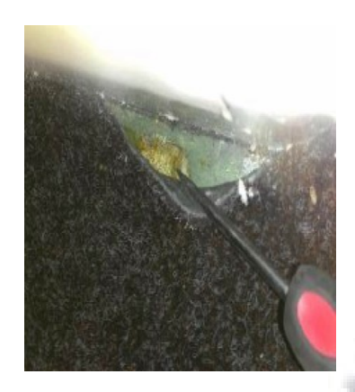
Item 5 - Ref: EA003019

The textured coating to the ceiling in the Office (Room 2) was accessed and no suspect materials were found.