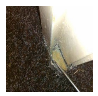
Item 8 - Ref: EA003019

The textured coating to the ceiling in the female wc (Room 4) does not contain asbestos.