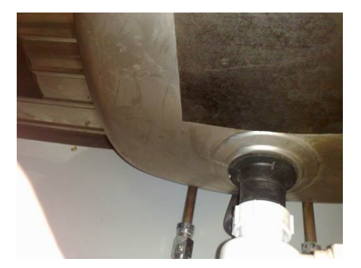
Item 57 - Ref: IC09/1452

The sink pad in area 76 does not contain asbestos.