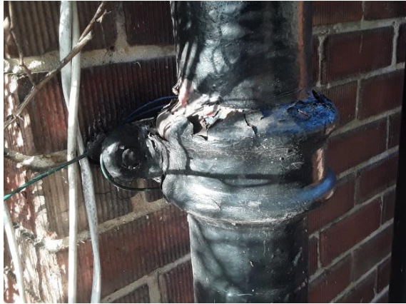
Item 7 – Ref: 20-28994-10

The joint insulation to soil pipe contains asbestos.