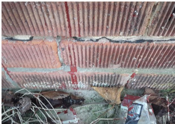
Item 8 – Ref: 20-28994-7

The damp proof course does not contain asbestos.