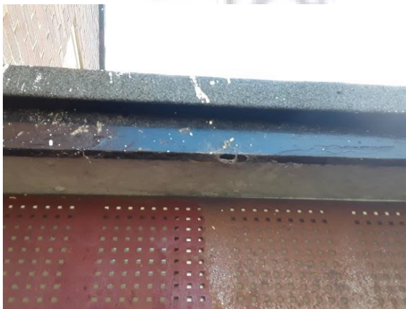
Item 9 – Ref: 20-28994-8

The damp proof course does not contain asbestos.