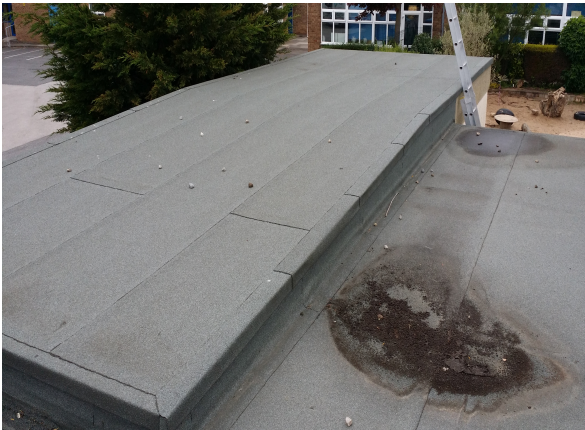
Item 17 Ref: 266111-4

The roof area 1 covering does not contain asbestos.