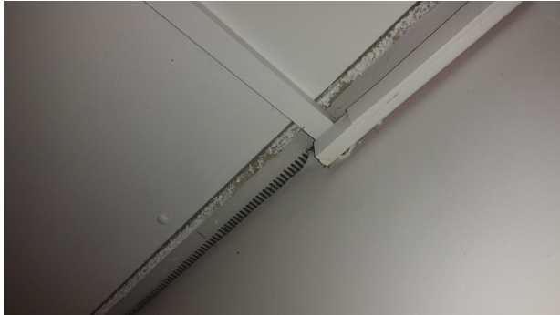
Item 10 Ref: 254938-3

The Textured Coating in 023/Entrance Lobby does not contain asbestos.