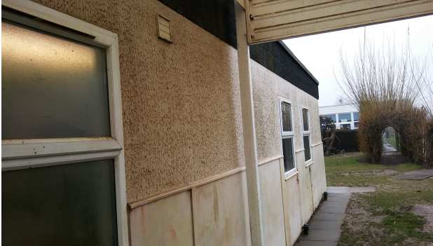
Item 14 Ref: As 254938-3

The Damp Proof Course - External does not contain asbestos.