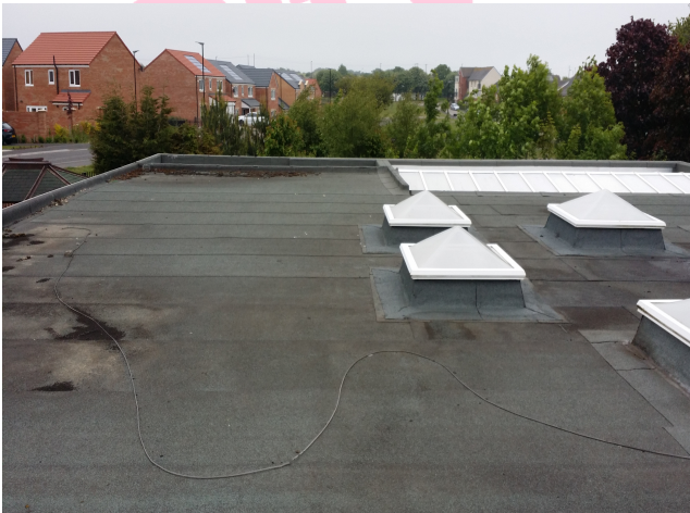
Item 15 Ref: 266111-1

The Textured Coating -External does not contain asbestos.