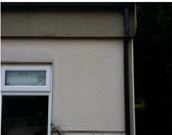
Item 18 Ref: 266111-5

The roof area 1 covering does not contain asbestos