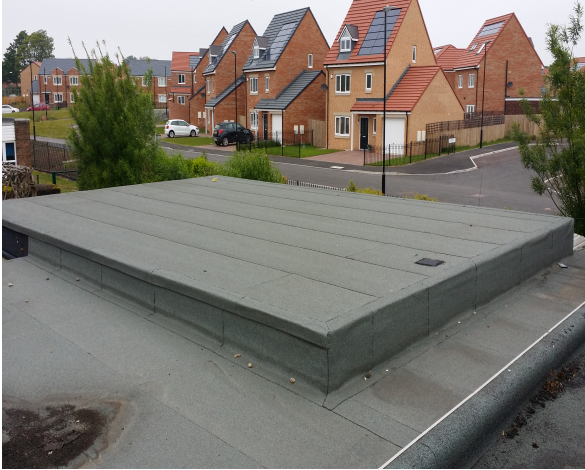
Item 16 Ref: 266111-3

The roof area 1 covering does not contain asbestos.