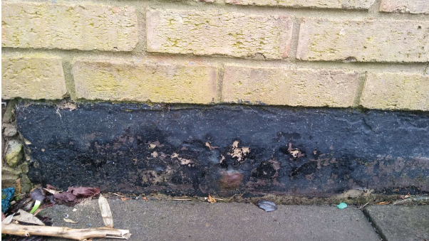
Item 13 Ref: 254938-5

The Damp Proof Course - External does not contain asbestos.