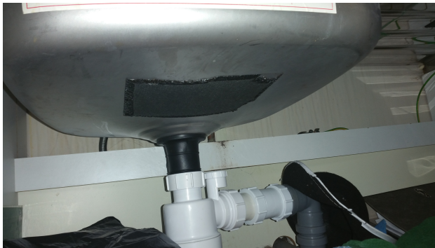
Item 11 Ref: 254938-2

The Textured Coating in 023/Entrance Lobby does not contain asbestos.