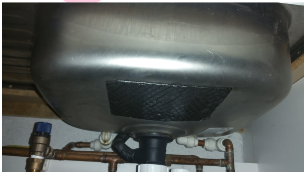
Item 12 Ref: 254938-1

The Sink Pad in 025/Staff area does not contain asbestos.