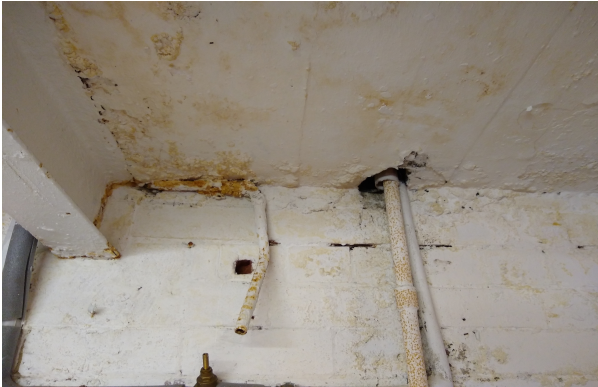
Item 34 Ref: 392632-20

The debris within ceiling pipework penetration to the boiler room (Rm -1/01) does not contain asbestos.