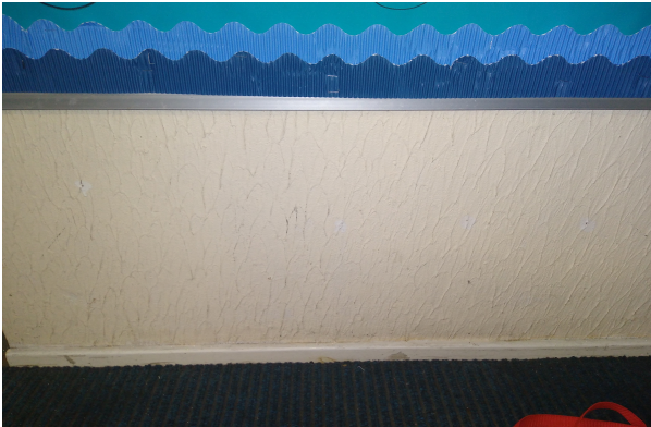
Item 35 Ref: 392632-22

The debris within ceiling pipework penetration to the boiler room (Rm -1/01) does not contain asbestos.