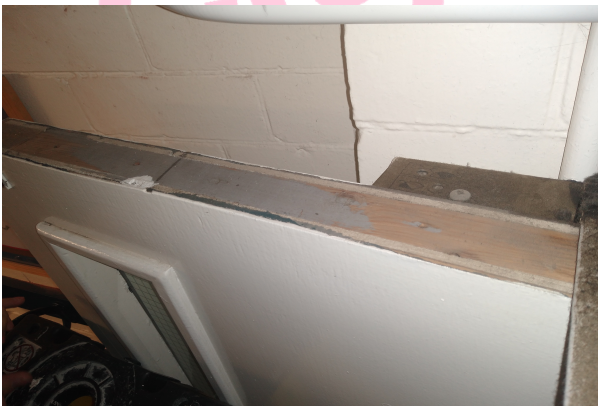
Item 36 Ref: 392632-23

The textured coating to walls in the lobby (Rm 0/03) does not contain asbestos.