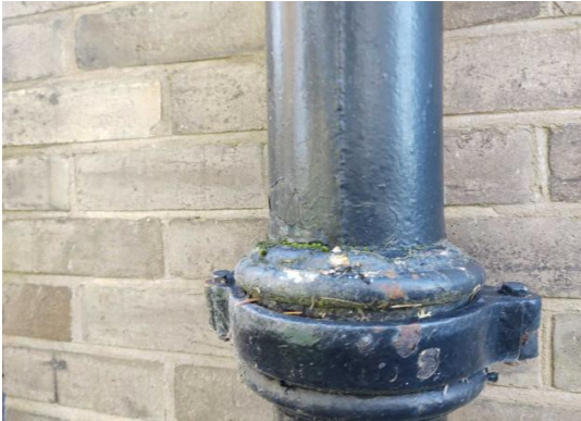
Item 43 Ref: 21-39567-31

The capping to soil pipe flanges (Area 129/ External) does not contain asbestos.