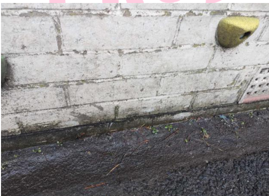
Item 45 Ref: 21-39567-33

The damp proof course to walls (Area 129/External) does not contain asbestos.