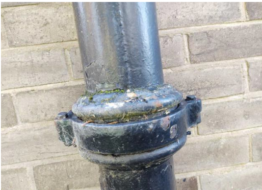
Item 44 Ref: 21-39567-31

The capping to soil pipe flanges (Area 129/ External) does not contain asbestos.