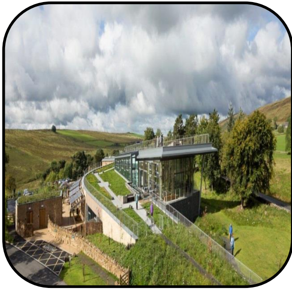
The Sill Green Roof Hexham

applications will need to provide a Pre Development Enquiry.