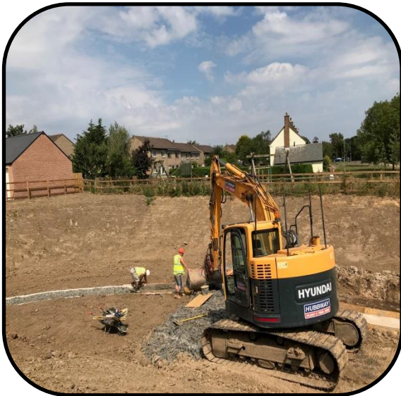
Basin in Construction in Warkworth Northumberland

The NE LLFA Local Standards are set out below with reference to the Non-Statutory Technical Standards for Sustainable Drainage in brackets.