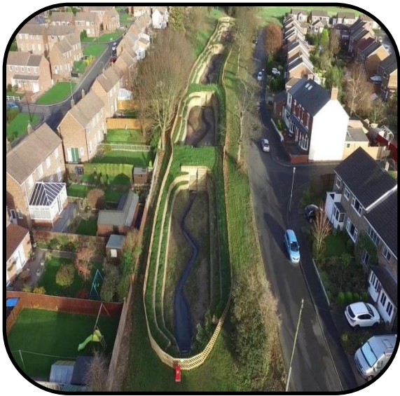
Swales in Witton Gilbert Durham

Local Standard 8 – Storm events should be checked as a minimum between 15 minutes and 360 minutes.