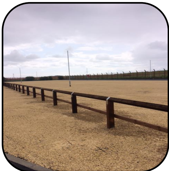
Permeable Paving Newcastle Airport