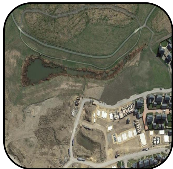
Elba Park SuDS Sunderland

Local Standard 4 – The NNE LLFA will set allowable discharge rates following Local Standards 1-3, unless the permissible discharge rate Northumbrian Water will allow to sewer is below GFRO rates.