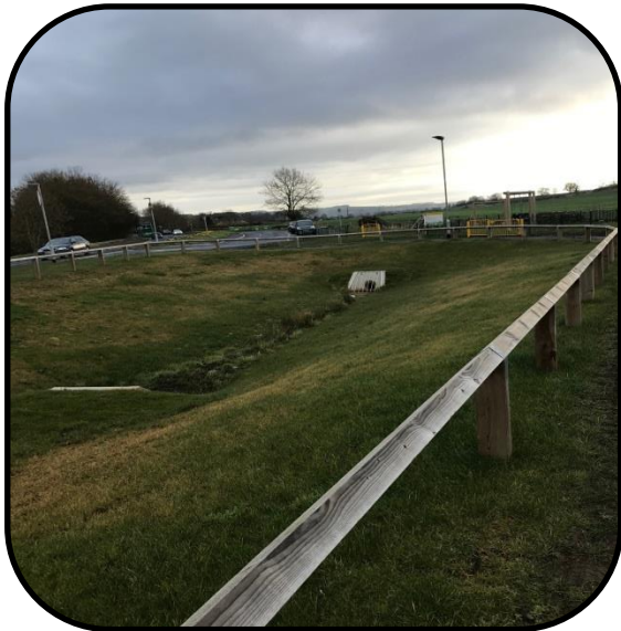
Swales in Hexham Northumberland

Local Standard 16 - A construction plan is required to show surface run off, any water receptors and an outline of mitigation measures.