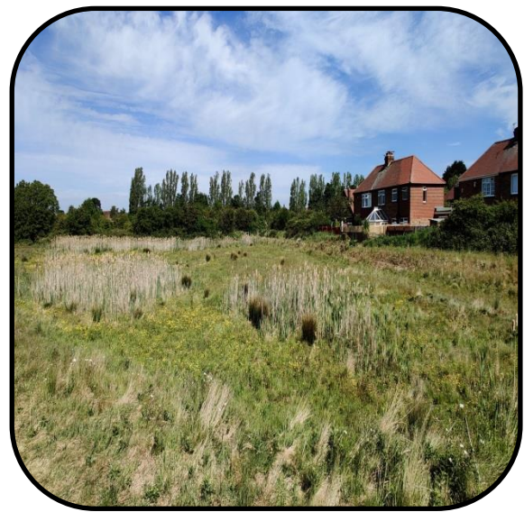
Monkseaton Flood Alleviation scheme

teams will occur through pre planning enquiry to support these applications. It will be expected that landscaping and ecology details will be referred to and described on drainage layouts and where required supported by additional plans before planning approval. Other drainage solutions such as tanked storage will be considered only on a site by site basis. A viability assessment will be required if multifunctional benefit vegetated SuDS are not proposed