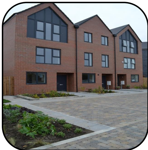
Permeable paving in Gateshead

Local Standard 12 – Overland flow modelling for surface water flood routes or other reasons may be required as part of formal submissions.