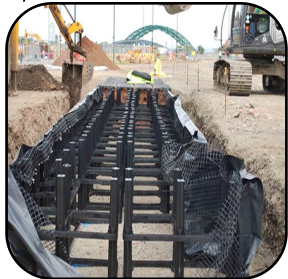
Storm Cells In Sunderland

Flood risk within the development (S7 – S9)