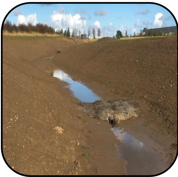
Swales under construction Gateshead

Local Standard 13 – To assess the risk of tide locking a combined tidal and surface water event must be assessed where the development is in or directly adjacent to flood zone 2 or 3.