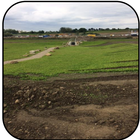
Lemington SuDS Basin

All the NE LLFAs are agreed that consultation with the LLFA during the pre-application stage is the only way of ensuring SuDS are best incorporated into development. In addition, some authorities offer a separate pre-application priority charged service relating to SuDS and some NE LLFAs adopt SuDS either via an estate rent charge or Community Infrastructure Levy (CIL). It is important to note that the adoption of development SuDS by the NE LLFA which this guidance refers to is separate to requirements of the Highway Authorities relating to highway drainage. Some Highway Authorities adopt SuDS too. To ensure the best design and any chance of adoption pre-application consultation must be undertaken. From 1 st April 2020 Northumbrian Water may adopt forms of SuDS considered sewers in line with Design and Construction Guidance March 2020.