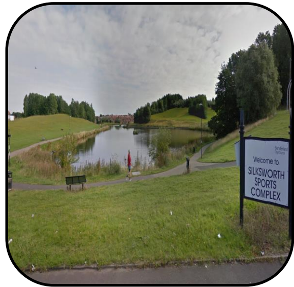
Silksworth Basin Sunderland

data can be found as Environment Agency Open Data .