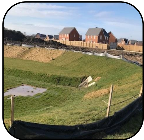
Dry Basin In Stobhill Morpeth