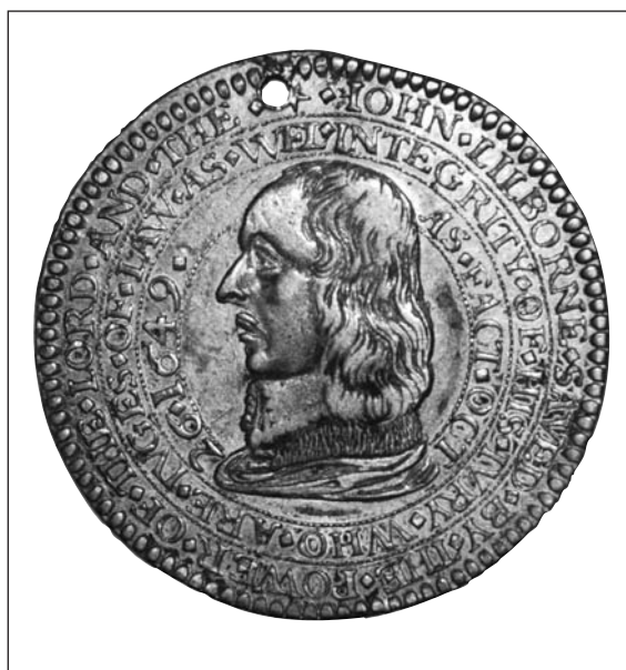
Commemorative medal 1649 - Sunderland Museum & Winter Garden.

Finally, what of his place in history? The Dictionary of National Biography has Lilburne as '...one who, before his time, made a case for a written constitution, a democratically elected legislature bound by law and something like a bill of rights.'