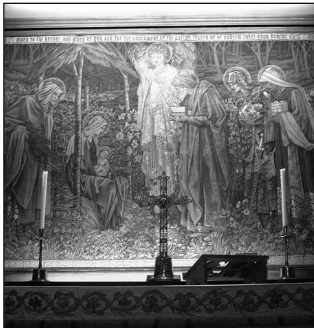
'Adoration of the Magi' by Burne-Jones

Of all the furnishings in the Sanctuary the most eye-catching is the Tapestry – by Burne-Jones. The subject is the 'Adoration of the Magi' based on the Cologne legend and is one of several copies produced.