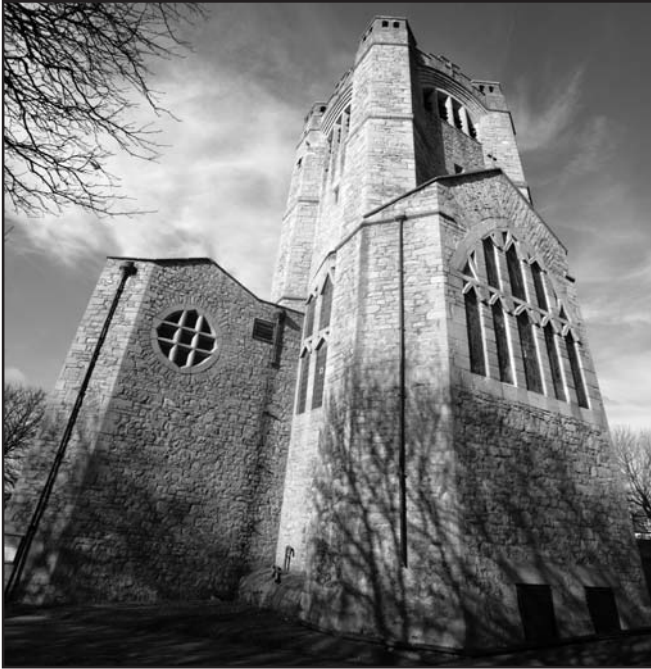
St. Andrew's in Roker