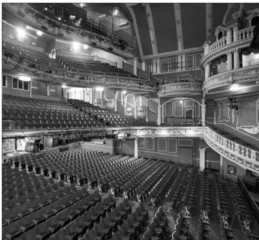
The interior of the Empire today

Sunderland Corporation took the unprecedented step of buying the theatre for £50,000 and it became the first "number one" theatre under civic control in the U.K.