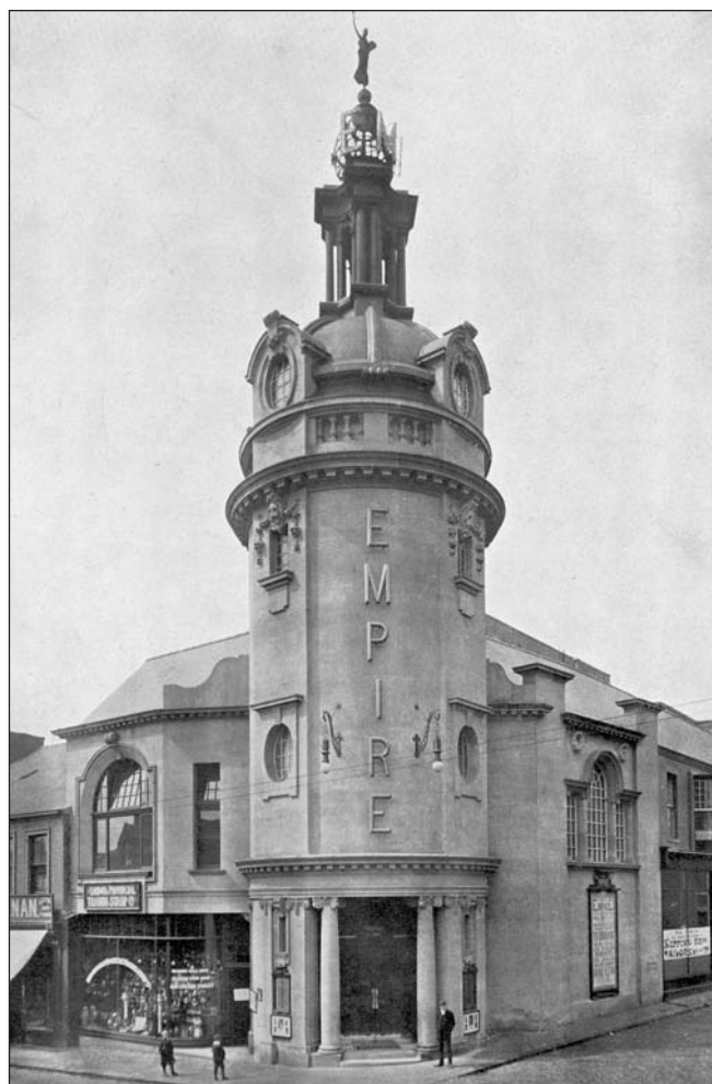
The original Sunderland Empire

well-to-do customers, but as music hall was for all classes, the working-class families had their own entrances. These were on the side street with their own pay-box; a small arched hatch set in the wall. Buskers entertained customers as they queued outside, attended by hot potato & roast chestnut vendors.