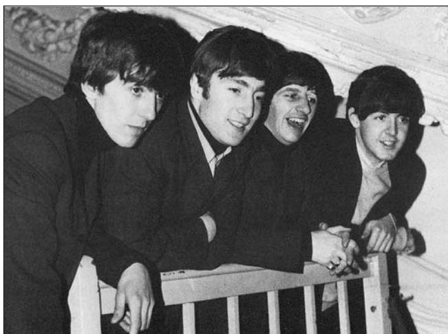
The Beatles prior to their 2nd performance at the Empire on Saturday 30 November 1963

round tower crowned with a dome and a revolving sphere which bore the statue of "Terpsichore" the Greek Goddess of dance, not as is commonly thought, Vesta Tilley. Shortly after the beginning of the 2nd World War a bomb fell nearby, badly rocking the building so the globe and statue were removed for safety. The original statue can still be seen in the hallway of the theatre and a replica stands at the top of the dome. The grand main entrance was for